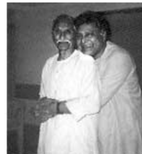
With actor-son Vikram Gokhale